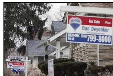
Housing: Problems in the housing industry may get worse in 2008 before improving. Besides dealing with the sub-prime mortgage crisis, Metro Detroit's home values may sag much of the year.

The sub-prime mortgage mess is far from over, the credit crunch and mass foreclosures will continue and the National Association of Home Builders contends Metro Detroit's home values may sag much of the year after dropping an average of 9.6 percent in 2007.